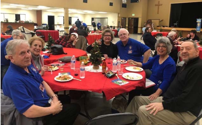
Enjoying dinner and the camaraderie while a few are already heading for seconds!

More than 40 Knights and family members joined in our Council's Family Christmas Party on December 17 th ! A potluck with ham, roast chicken and even Mac & Cheese and a myriad of delicious side dishes, salads and desserts. Music was digitally recorded and provided by Knights for many favorite renditions of Christmas songs we all remember and enjoy.