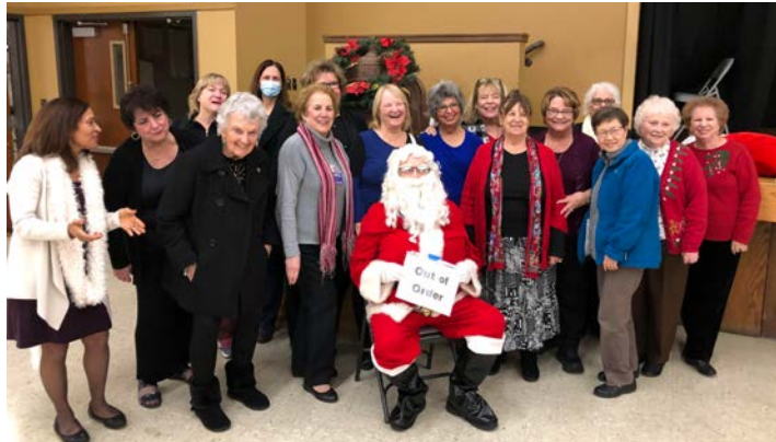
Santa greeting all of the Columbiettes at the Christmas Party

Save the Date Sat., Feb. 26, 2022 Mardi Gras Dinner Join the Fun!