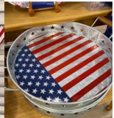
Flag Down Some Drinks?