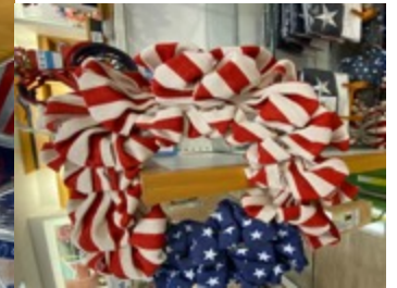
Wow, How long to make origami flag wreaths?