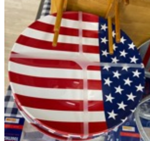
Burgers, Potato Salad & Patriotism?