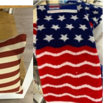
Used by Patriotic Bartenders Only?