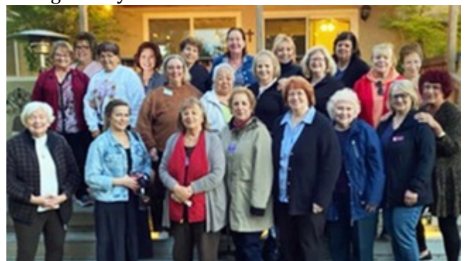
First In-Person Columbiette Meeting in 15 Months, the May Elections!