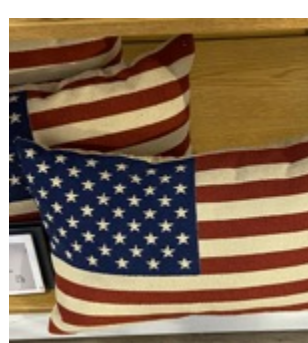
Old Glory Helps me Sleep Better At Night?